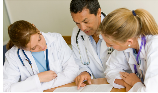
Observe and analyze communication in healthcare. Transcribe medical encounters, record behavior on video, and collect physiological data. With The Observer XT you can easily keep all your data in sync.